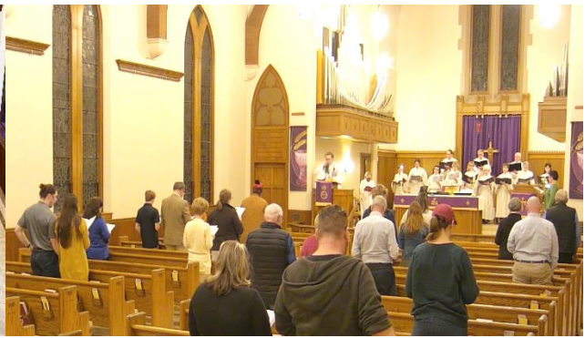
Ash Wednesday Services