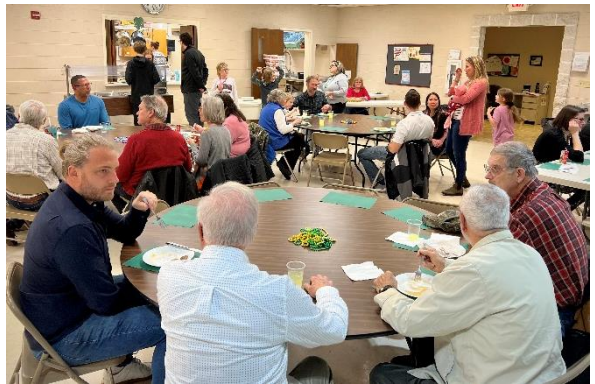
Shrove Tuesday Pancake Supper!