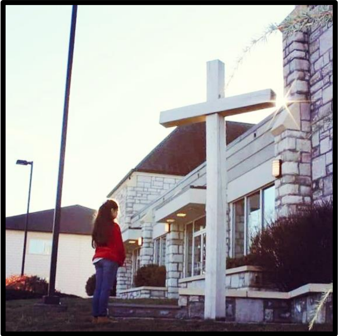
A parent of Second Home students gives thanks for the care and services provided to our community's children.