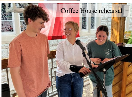
Coffee House rehearsal