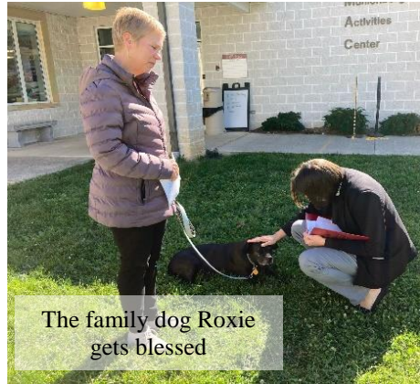
The family dog Roxie gets blessed