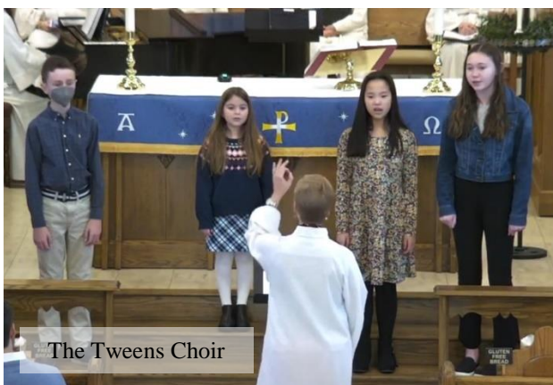
The Tweens Choir