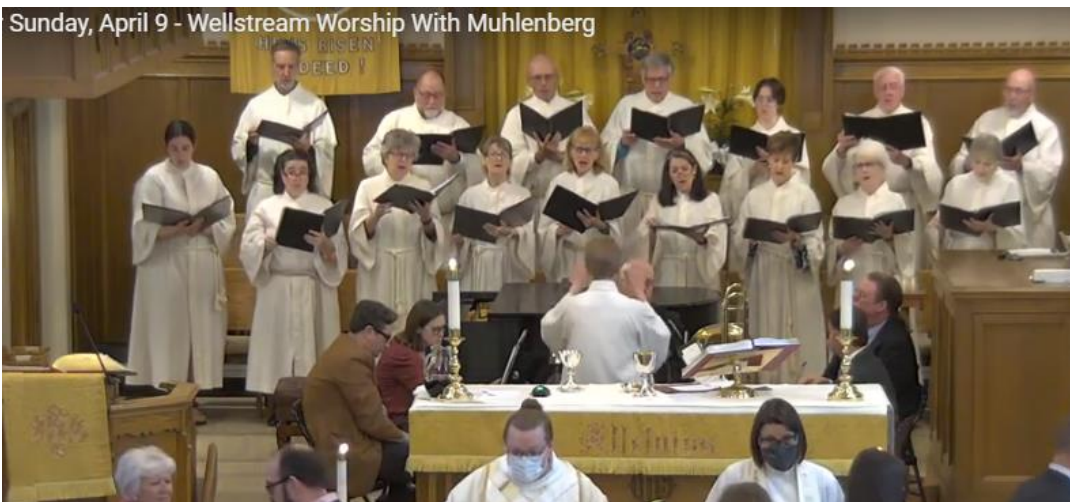
Sunday, April 9 - Wellstream Worship With Muhlenberg