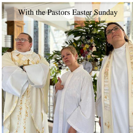
With the Pastors Easter Sunday