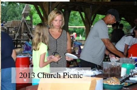
2013 Church Picnic