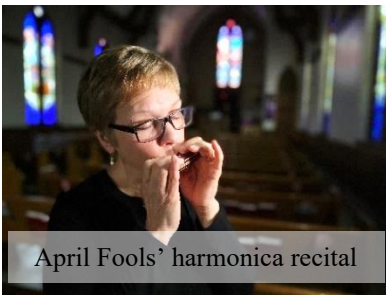
April Fools' harmonica recital