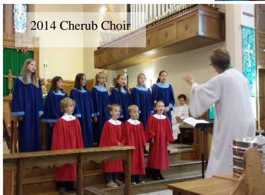
2014 Cherub Choir