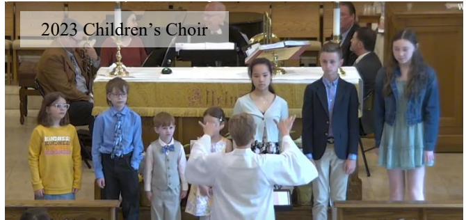
2023 Children's Choir