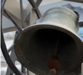
The bell tolled after the name of each member who died last year was read.