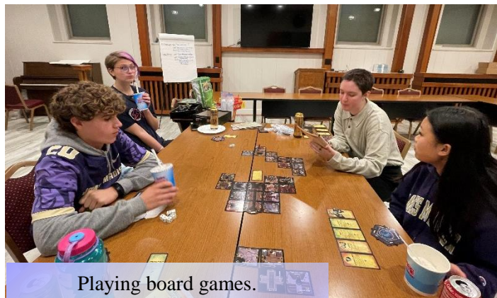
Playing board games.