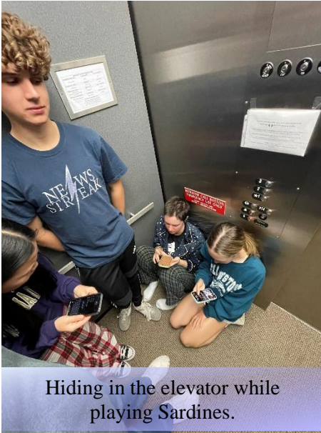
Hiding in the elevator while playing Sardines.

Our high school youth had a great weekend of fun and fellowship last Saturday, enjoying food, board games, movies, and classic lock-in games throughout the evening at Muhlenberg. We're already excited for our next chance to do this. In the meantime, we are counting down the days to Winter Celebration (Feb. 2 - 4, 2024) with youth from all across Virginia! Enjoy these fun moments from our time together.